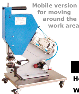
Mobile version for moving around the work area